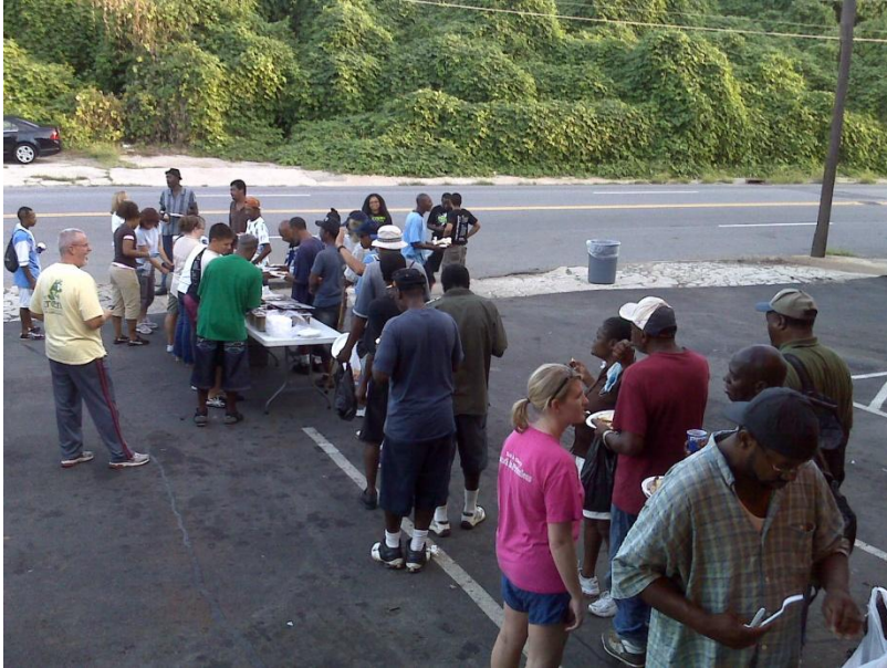
← Feeding on the street.