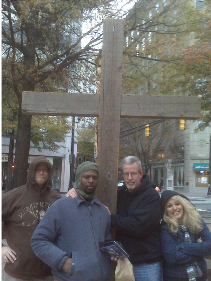
← Some more team-mates and a street-person we were ministering to.