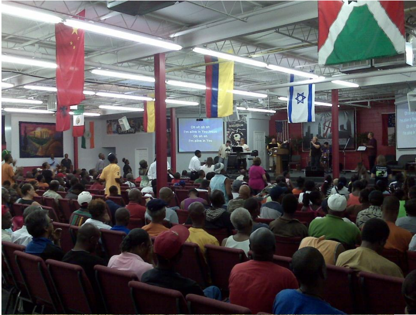
← A service at Rescue Atlanta