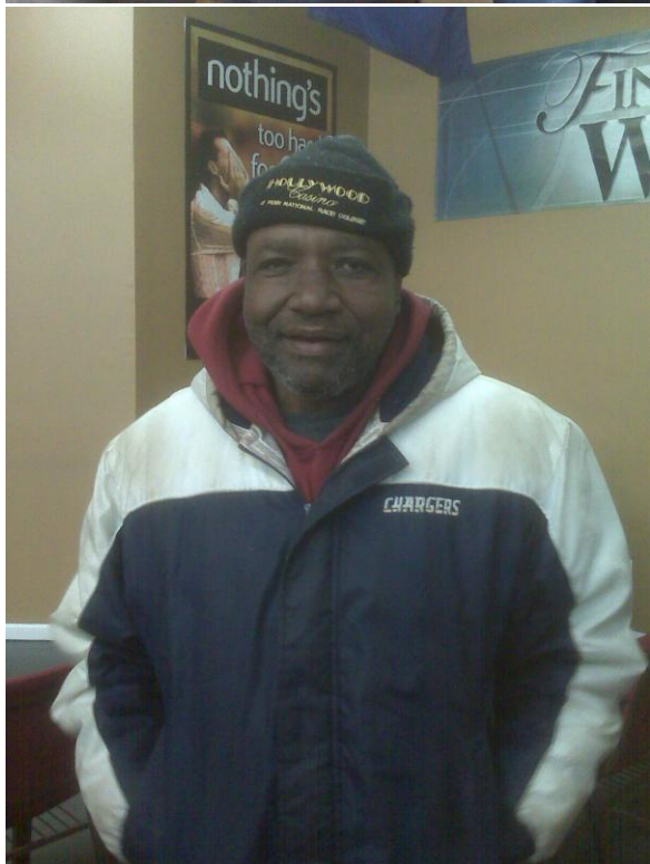
This guy got healed of a back problem. He couldn't bend over before. Now you see him bending over. He kept saying, "I couldn't do that before!" Praise God!