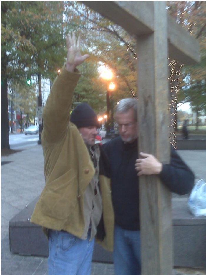
← This guy was drunk, but here he is getting prayer by one of our teammates.